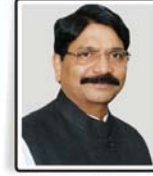
HON. RAVINDRA WAIKAR FORMER STATE MINISTER