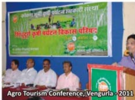
Agro Tourism Conference, Vengurla - 2011