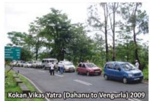
Kokan Vikas Yatra (Dahanu to Vengurla) 2009