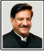
HON. PRITHVIRAJ CHAVAN FORMER CHIEF MINISTER