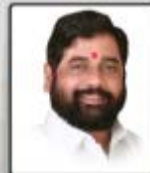
HON. EKNATH SHINDE MINISTER - MAHARASHTRA

"Through the Global Kokan Festival, a resolution has been taken to bring Kokan to the map of the world in the field of tourism and the path has begun. There is a need to work together by giving a lot of support to the organization."