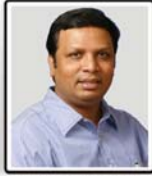
ADV. ASHISH SHELAR FORMER MINISTER