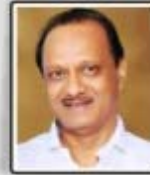
HON. AJITDADA PAWAR FORMER DEPUTY CHIEF MINISTER - MAHARASHTRA

"Considering the vast coastal landscape of Kokan and the nesting beauty on the corners, we have a great opportunity for tourism here and we should change our mentality towards Kokan area and to look at its tourism, and I am happy to announce that for development of Kokan tourism I am sanctioning Rs 50 cr. in the upcoming budget. Kokan Bhumi Pratishthan should coordinate all development work for Kokan."