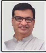
HON. BALASAHEB THORAT MINISTER - REVENUE