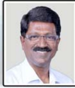
HON. ARVIND SAWANT MP