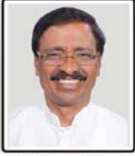
HON. VINAYAK RAUT MP