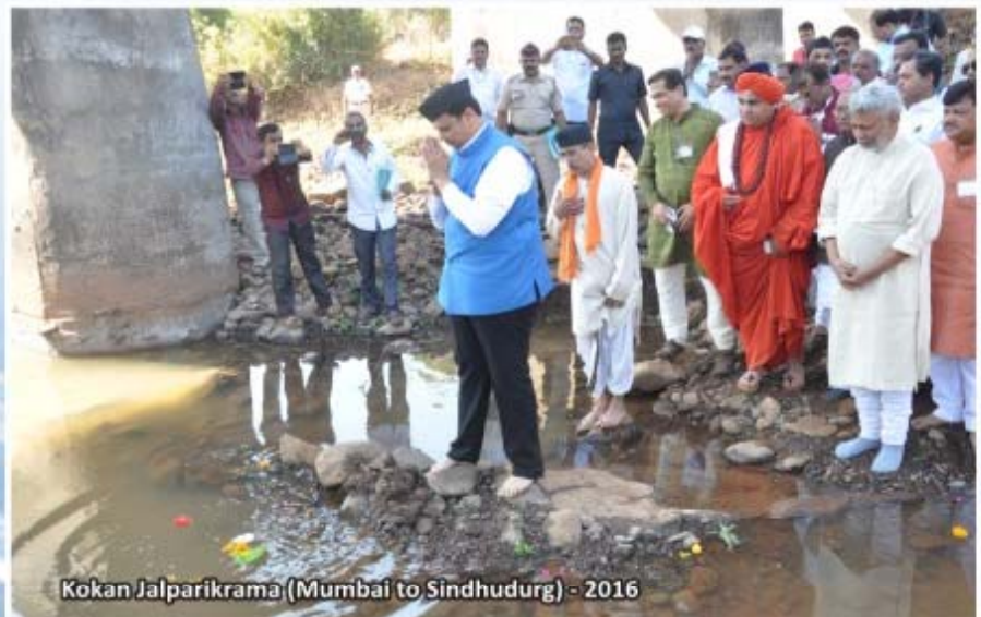
Kokan Jalparikrama (Mumbai to Sindhudurg) - 2016