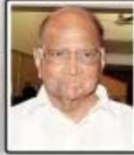
HON. SHARADCHANDRAJI PAWAR FORMER UNION MINISTER

"It is heartwarming to see that I was able to stay on a good program. You're all working great. The enthusiasm should be maintained that everyone is trying to get together for the development of Kokan. And if you can do this work in Kokan today, it will give very big boost to Maharashtra's economy."