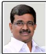
RAJIV PATIL FIRST MAYOR, VASAI-VIRAR