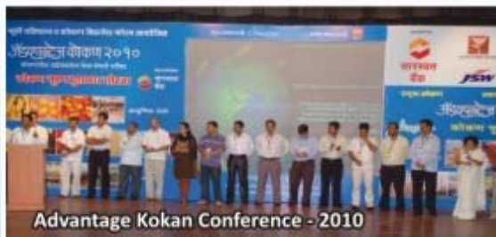
Advantage Kokan Conference - 2010