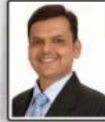
HON. DEVENDRAJI FADNAVIS FORMER CHIEF MINISTER - MAHARASHTRA

"People of Kokan region have done a lot of work in their field & I believe that kokan cannot be left behind if all the people decide to come together for the development of kokan. The state government will also fully stand behind for the development of Kokan. For the development of tourism in Kokan, You must do whatever you have been requested through the Global Kokan Festival."