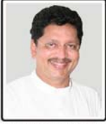
HON. DEEPAK KESARKAR FORMER STATE MINISTER