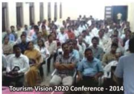
Tourism Vision 2020 Conference - 2014