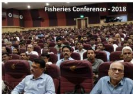
Fisheries Conference - 2018