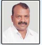
HON. RAJENDRA GAVIT MP