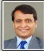
HON. SURESHJI PRABHU FORMER UNION MINISTER

"I would like to thank the GKF Organizers for presenting the concept of Global Kokan. Through the medium of Make in Kokan we got to see goods that has been produced while developing the Kokan, we have to look into how to preserve the status of Kokan. We are soon starting a tourism related organization in Kokan."