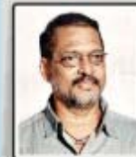
HON. NANA PATEKAR ACTOR

"The Global Kokan Festival is a hub for Kokan settlers today. People from all walks of life in Kokan are present under one umbrella that we can see today. I am publishing a book soon after playing a warm and intimate role in my hometown of Konan. Through the interaction of each other, we are excited to keep the Kokan land with the golden letters on the global map."