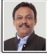
HON. VINOD TAWADE FORMER MINISTER