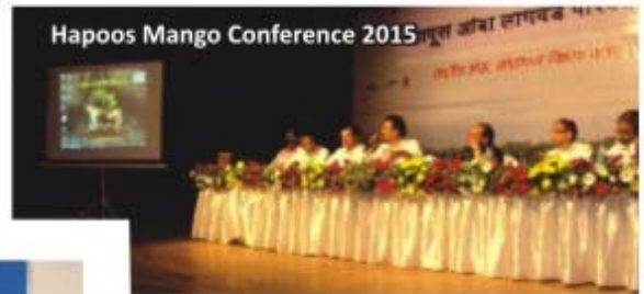
Hapoos Mango Conference 2015