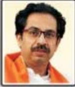
HON. UDDHAVJI THACKERAY CHIEF MINISTER - MAHARASHTRA

"Kokan has an outstanding form of nature's richness in this festival. Tourism, products, food culture and folk art in Kokan can be seen as well. We are committed to the best cooperation for the overall development of Kokan."