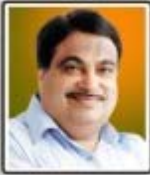
HON. NITINJI GADKARI UNION MINISTER-ROAD TRANSPORT & HIGHWAYS

"I sincerely Congratulate & thank all of you for organizing this event by keeping aside the politics on the occasion of Global Kokan Festival. I think that if we start implementing right policies, people will go from Mumbai to Kokan instead of Kokan to Mumbai. Enriched kokan will be created. Thousands of youth will get employment & Kokan will be considered as a great tourist destination on the world map."