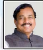
HON. SUNIL TAKTARE MP