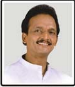
BHAI JAGTAP MLC