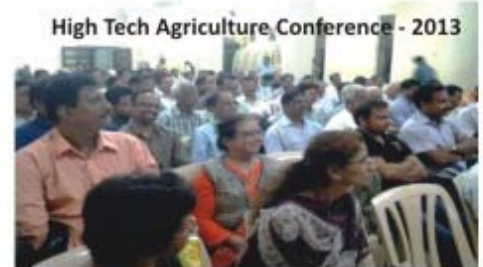
High Tech Agriculture Conference - 2013