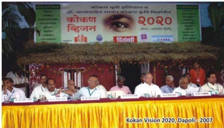
Kokan Vision 2020, Dapoli - 2007