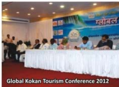
Global Kokan Tourism Conference 2012