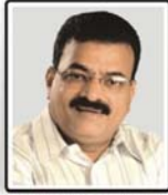
BHASKAR JADHAV FORMER STATE MINISTER